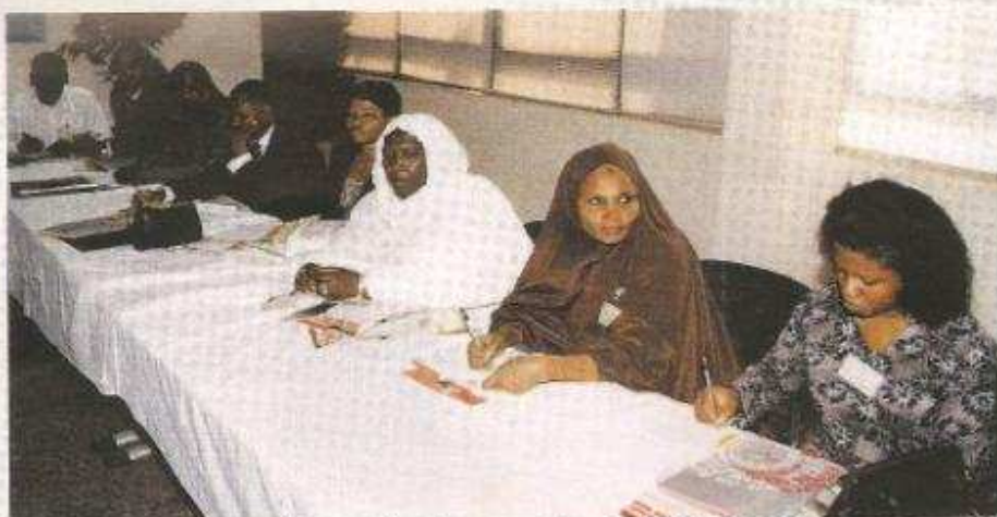
● Community advocates champion NPT advocacy