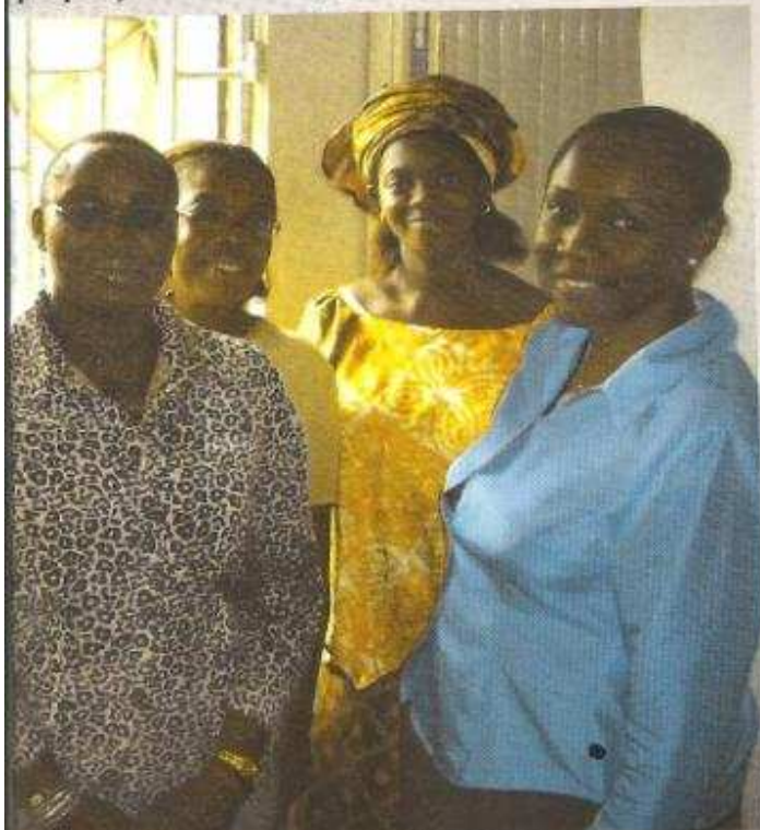
Benefit from microbicide when available

Culled from 'Waiting for an answer' By RACHEL SCHEIER, August 14, 2005, published in HERALD NEWS (New Jersey)