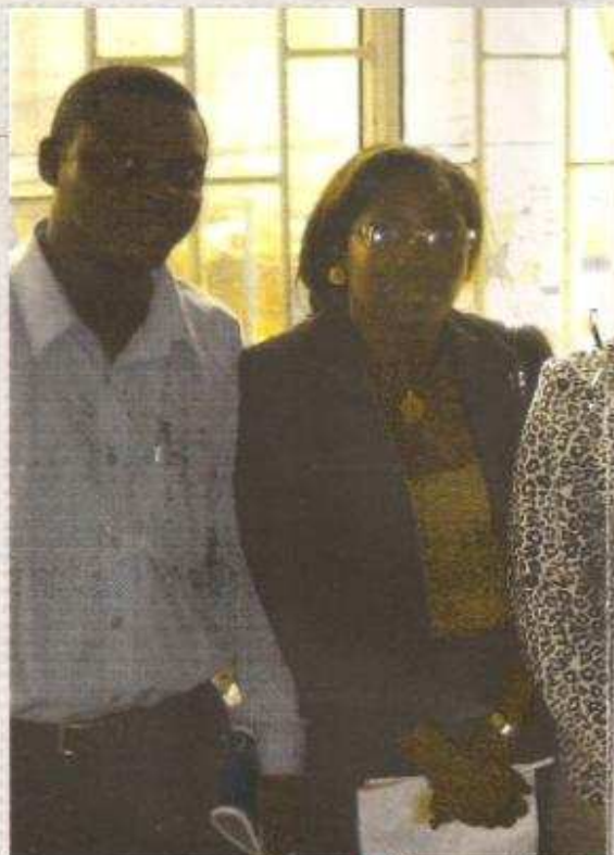
● Women will most l

Some 60 products are now in the pipeline; they include substances that range from seaweed extract to advanced antiretroviral drugs. Five are in the last stage of testing. There is no guarantee